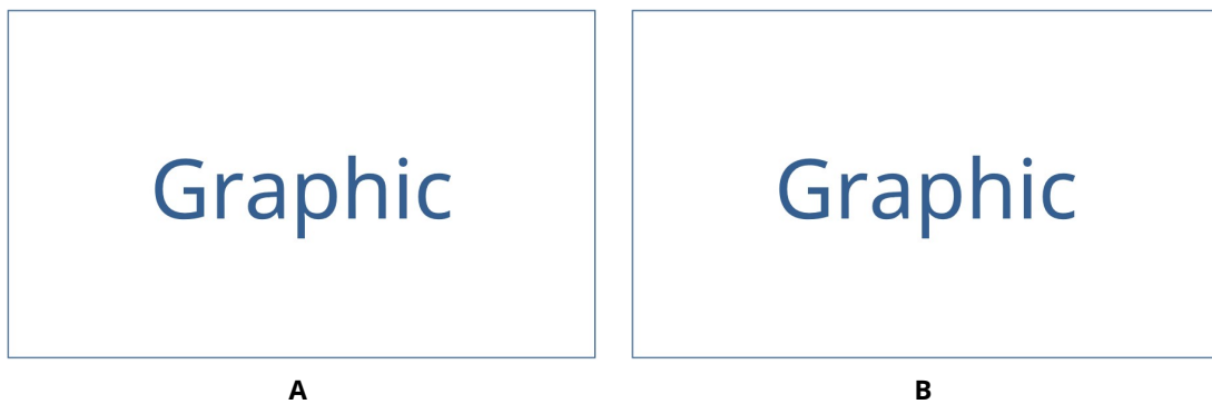
Figure S2 Figure caption. Figures should be placed in the main text near to the first time they are cited.