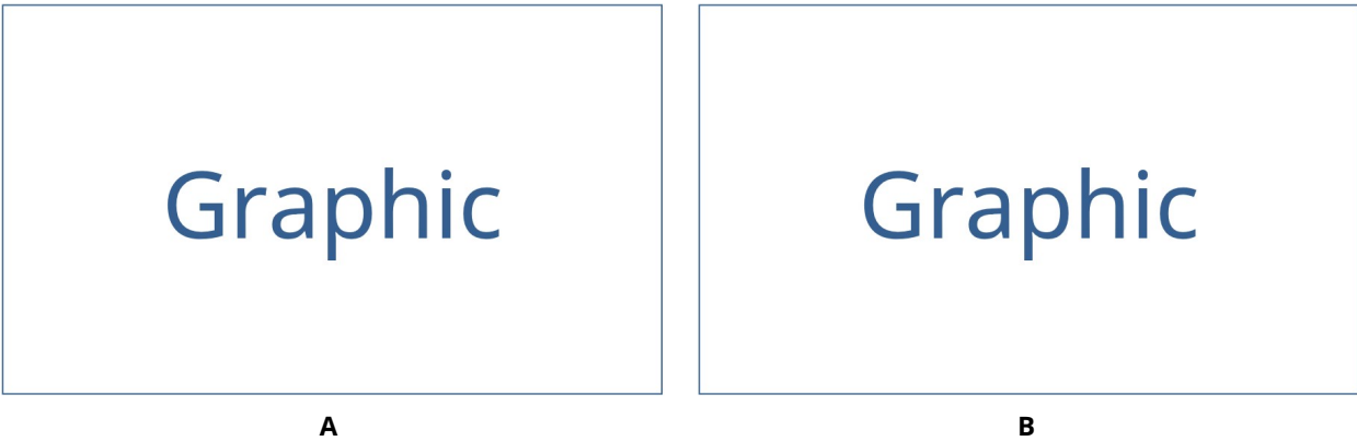
Figure 2 Figure caption.