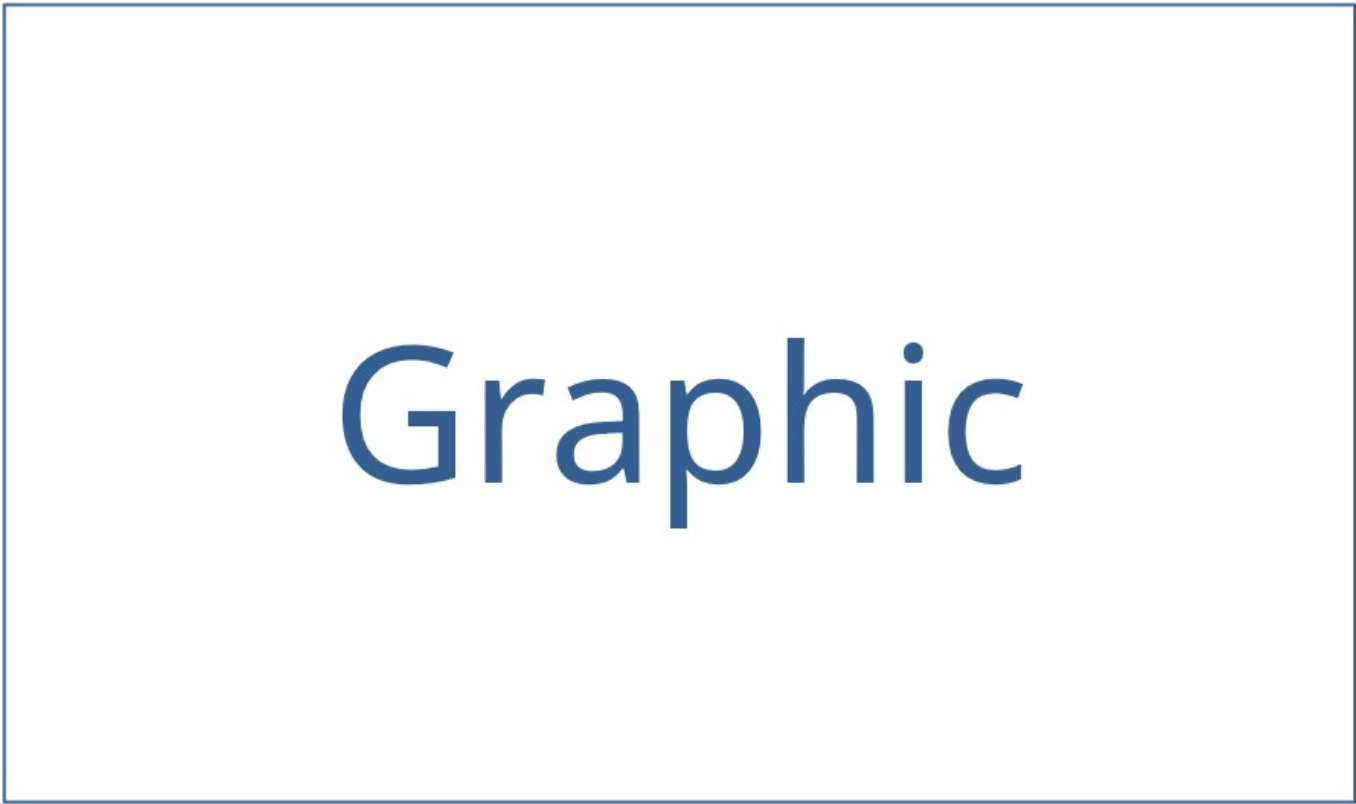
Figure 4 Figure caption.Figures should be placed in the main text near to the first time they are cited.